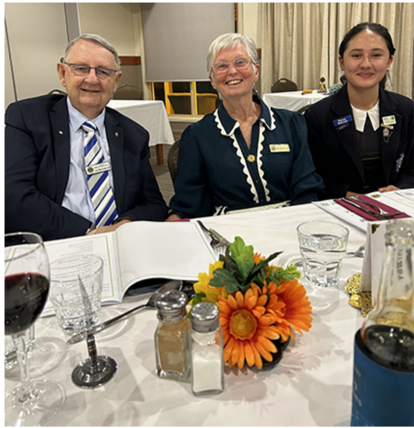
Lions and guests travel to Pittsworth for District Youth of the Year Final.